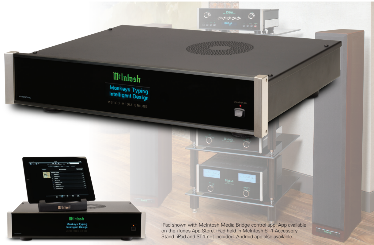
iPad shown with McIntosh Media Bridge control app. App available on the iTunes App Store. iPad held in McIntosh ST-1 Accessory Stand. iPad and ST-1 not included. Android app also available.